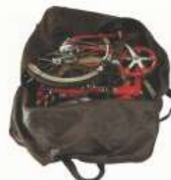
New World Tourist folded and packed into a TravelBag