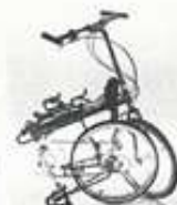
Turn front wheel and swing rear wheel under frame.