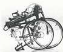
Pop stem up and place next to frame.

The New World Tourist quick-folds in seconds for travel on a bus or train, or storage in a trunk or closet.