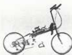
Fold seat mast down next to main frame.